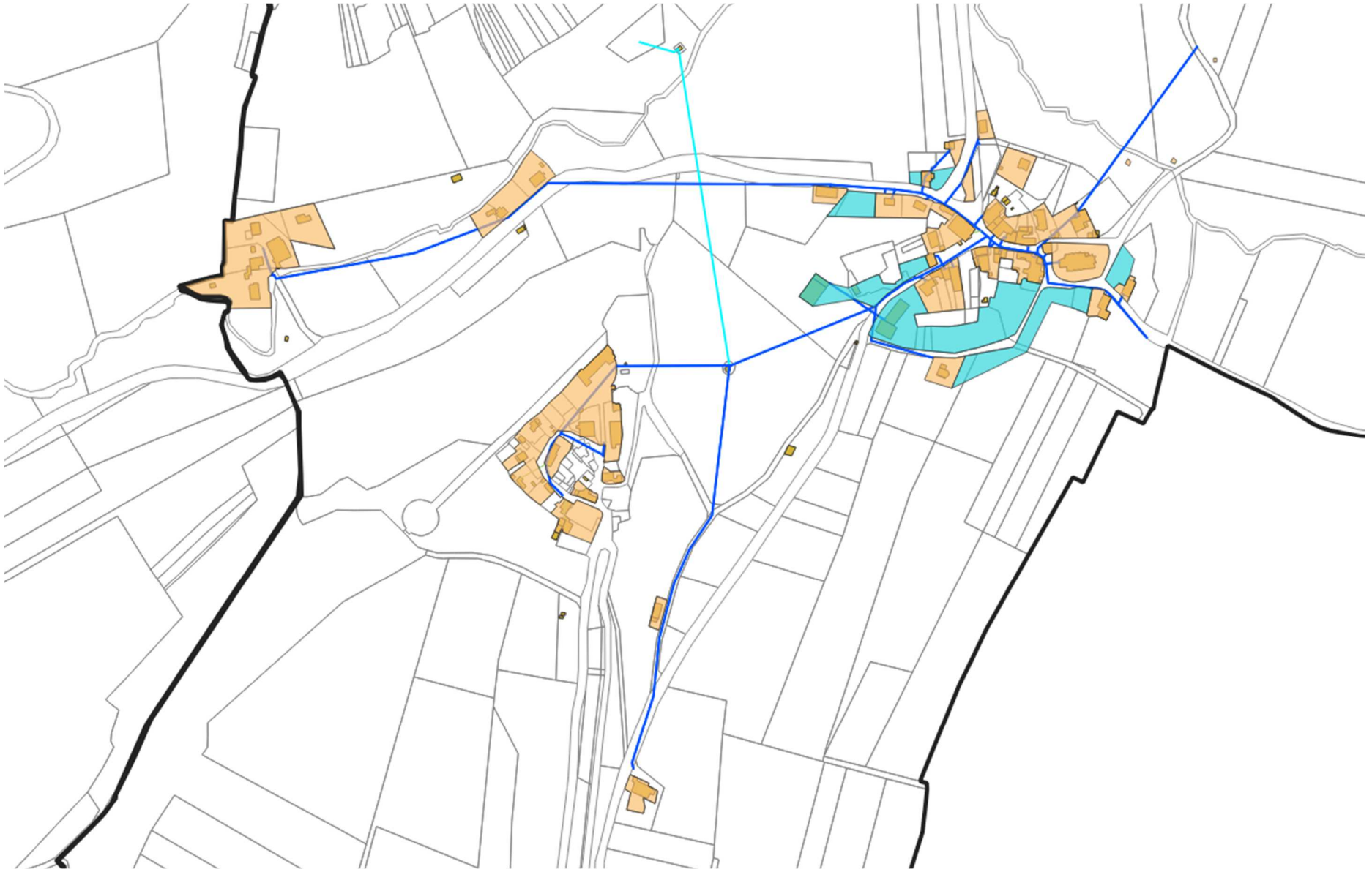
Figure 27: Schéma de distribution